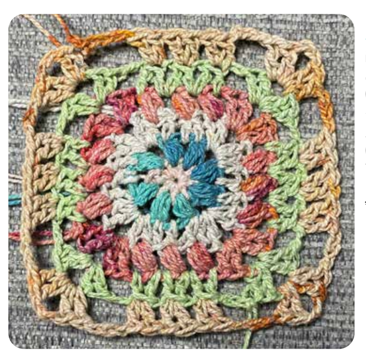
Round 6: Standing dc into any ch2 sp. Dc, ch2, 2dc into the same ch2 sp. Ch3, 2dc into the top of each of the 3 dc2tog. Ch3. ((2dc, ch2, 2dc) into the ch2 sp. Ch3, 2dc into the top of each of the 3 dc2tog. Ch3.) repeat 3 times. Sl st to the standing dc to join. (12dc2tog, 4Odc, 4x ch2 sp, 8x ch3 sp). Fasten off. Change colour.