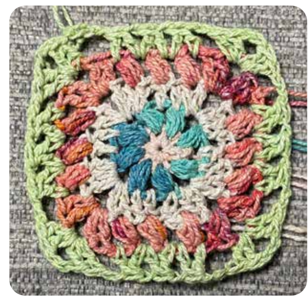
Round 5: Standing dc into any ch2 sp. Dc, ch2, 2dc into the same ch2 sp. Ch2. Dc2tog over the next 2 chl sp. Chl. (Dc2tog in the chl sp just used, and the next chl sp, chl) twice. Chl. ((2dc, ch2, 2dc) into the ch2 sp. Ch2. Dc2tog over the next 2 chl sp. Chl. (Dc2tog in the chl sp just used, and the next chl sp, chl) twice. Chl.) repeat 3 times. Sl st to the standing dc to join. (12dc2tog, 12dc, 12x ch2 sp, 4x chl sp). Fasten off. Change colour.