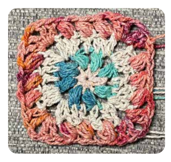
Round 4: Standing dc into any ch2 sp. Dc, ch2, 2dc into the same ch2 sp. (Ch1, sk lst, BS) 3 times. Ch1. ((2dc, ch2, 2dc) into the ch2 sp. (Ch1, sk lst, BS) 3 times. Ch1.) repeat 3 times. Sl st to the standing tr to join. (12BS, 12dc, 4x ch2 sp, 16x ch1 sp). Fasten off. Change colour.