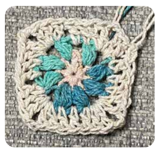
Round 3: Standing dc into any ch2 sp. Dc, ch2, 2dc into the same ch2 sp. Dc into the top of the BS, dc into ch2 sp, dc into the top of the next BS.

((2dc, ch2, 2dc) into the ch2 sp. Dc into the top of the BS, dc into ch2 sp, dc into the top of the next BS) repeat 3 times. Sl st to the standing dc to join.